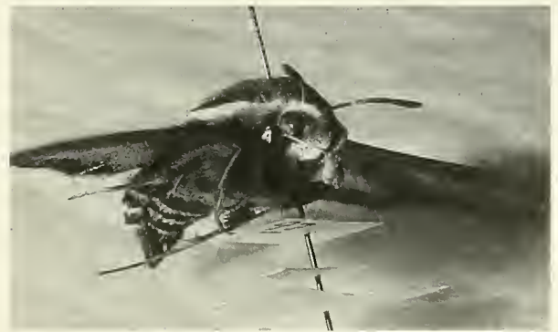
FIG. 4. Anterior/lateral view, Hyles gallii (Rottenburg), with pollinia from Platanthera praeclara attached to eyes. Note the large viscidium cemented to lower-center of eye, with massulae projected forward.